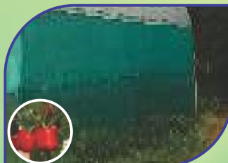
Dome Shaped Poly Shade Net House