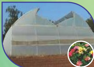
Naturally Ventilated Poly House

For Higher Crop Productivity and round the year Crop Cultivation