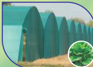
Dome Shaped Shade Net House