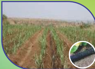
Porus Pipe System