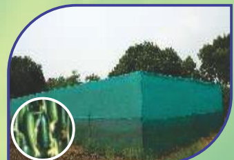
Flate Shaped Shade Net House